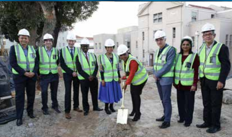
Neuroscience Centre Ground-breaking Celebration, 12 June 2018