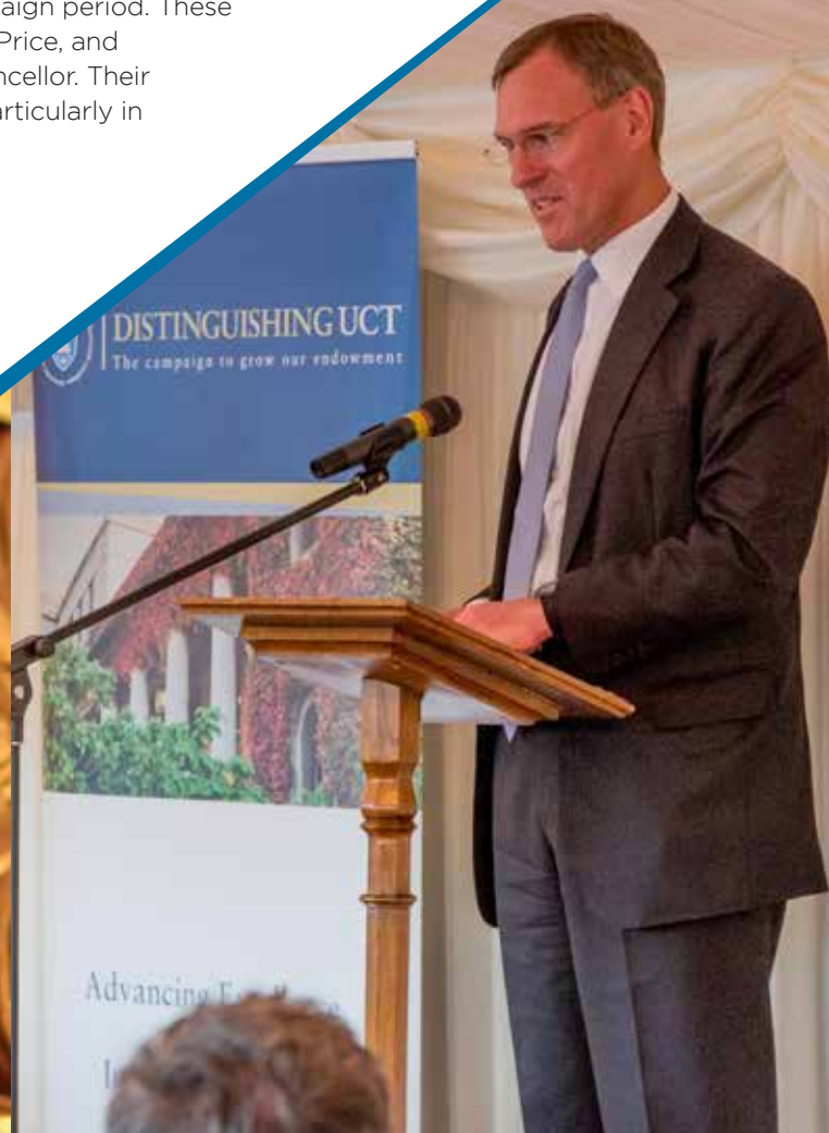
Campaign Dinner at the House of Lords, Palace of Westminster, London, 17 May 2018

Meetings and events were arranged in most of the leading international centres where the university has a notable alumni presence, and naturally throughout South Africa to ensure significant local alumni support. In South Africa many campaign activities were generously supported by corporate SA who sponsored several events.