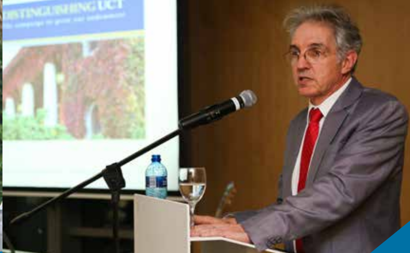
Campaign Dinner at FNB Portside, 06 September 2017