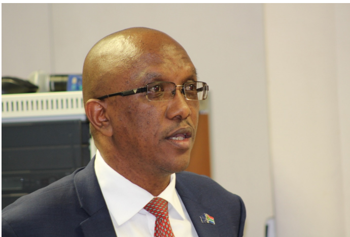
Mr Kimi Makwetu, Auditor General