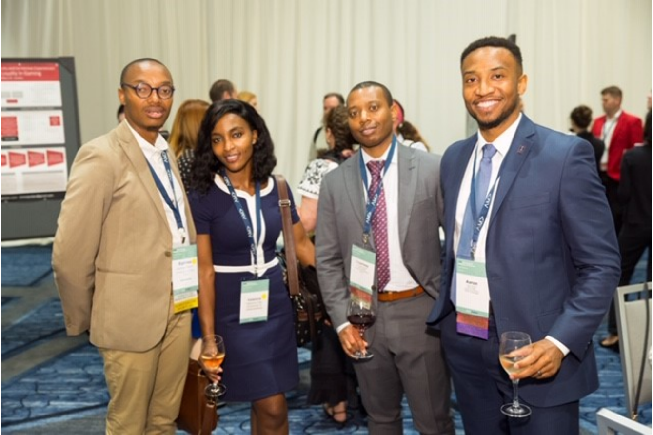
“Fancy meeting you here”