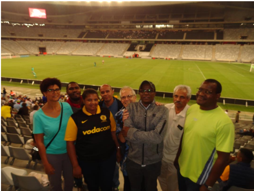
NGP at Cape Town Stadium

In the 1960s and 70s Cape Town City used to play at Hartleyvale, on the banks of the Liesbeek river. Some of the more aged members of the cohort can remember those times and even attended a game or two. But Cape Town City disappeared after the National Football League was disbanded in