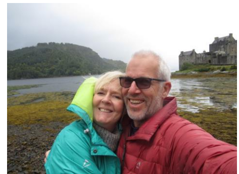
Castle Romance in the Scottish Highlands