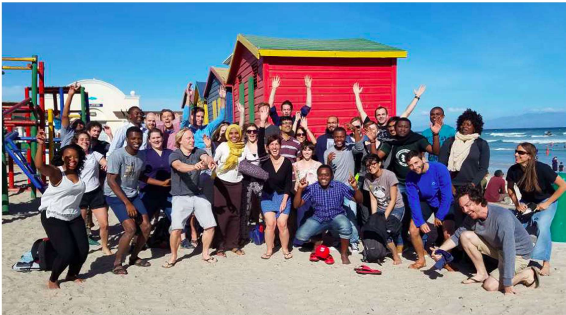
Image: 2017 summer course participants concluding week two on the beach